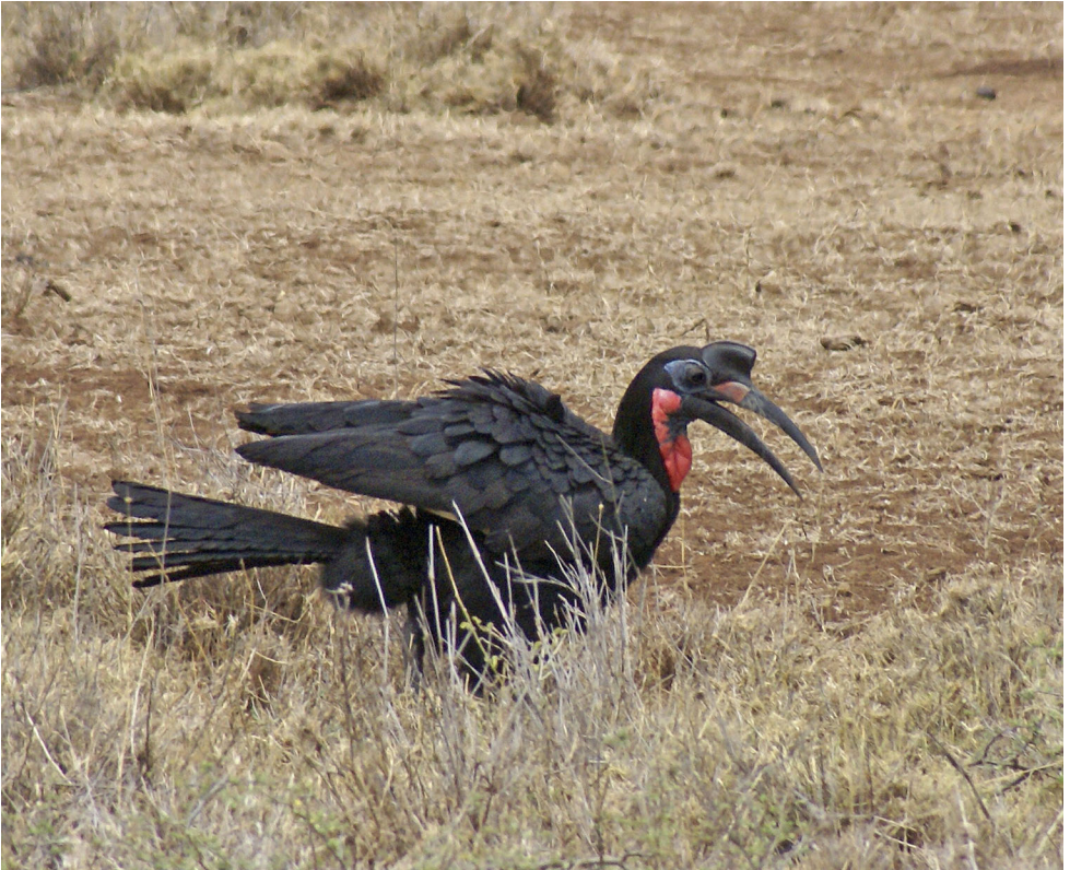
Northern Ground Hornbill

Wassadoo attracts many birds, with previous visits recording Red-throated, Green and Northern Carmine Bee-eaters, Greater Honeyguide, Grey-headed Bushshrike, Red-shouldered Cuckoo-shrike, Yellow-bellied and Senegal Eremomelas, Swamp Flycatcher, White-crowned Robin-chat, Blackcap and Brown Babblers, Lesser Blue-eared Starling, African Pied Wagtail, Orange-cheeked Waxbill, Broad-tailed Paradise Whydah, Vitelline Masked Weaver and Pygmy Sunbird.